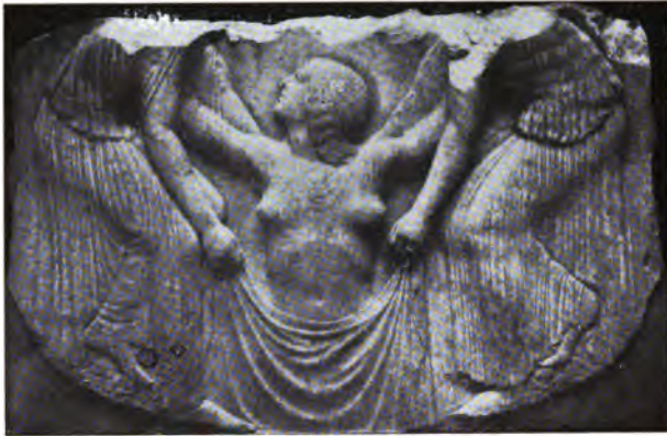
Fig. 31. Birth of Aphrodite from the Sea.

of precious gold. Her delicate neck and white bosom they adorned with chains of gold, wherewith are bedecked the golden-snooded Hours themselves, when they come to the glad dance of the Gods in the dwelling of the Father. And when they had adorned her in all goodliness they led her to the Immortals, who gave her greeting when they beheld her, and welcomed her with their hands; and each God prayed that he might lead her home to be his wedded wife, so much they marveled at the beauty of the fair-garlanded Cytherean. ( Homeric Hymn to Aphrodite. )